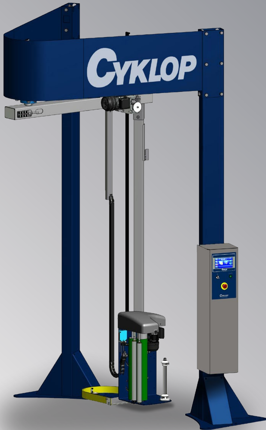
Semi Automatic Arm Wrapper CTA 300